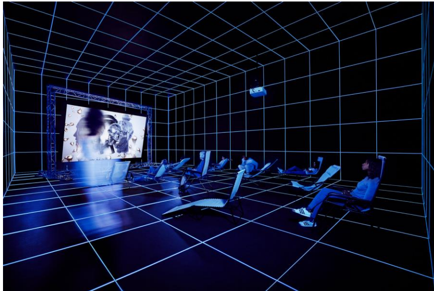
Installation view of Hito Steyerl's Factory of the Sun (2015). Courtesy of the artist and Andrew Kreps Gallery, New York.

Histories of Perspectives International Symposium Thursday 17 and Friday 18 October, 2024