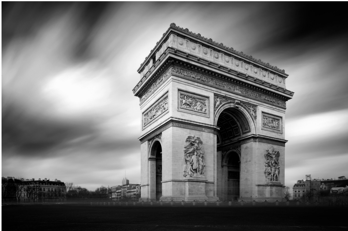
Arc de Triomphe, Paris.