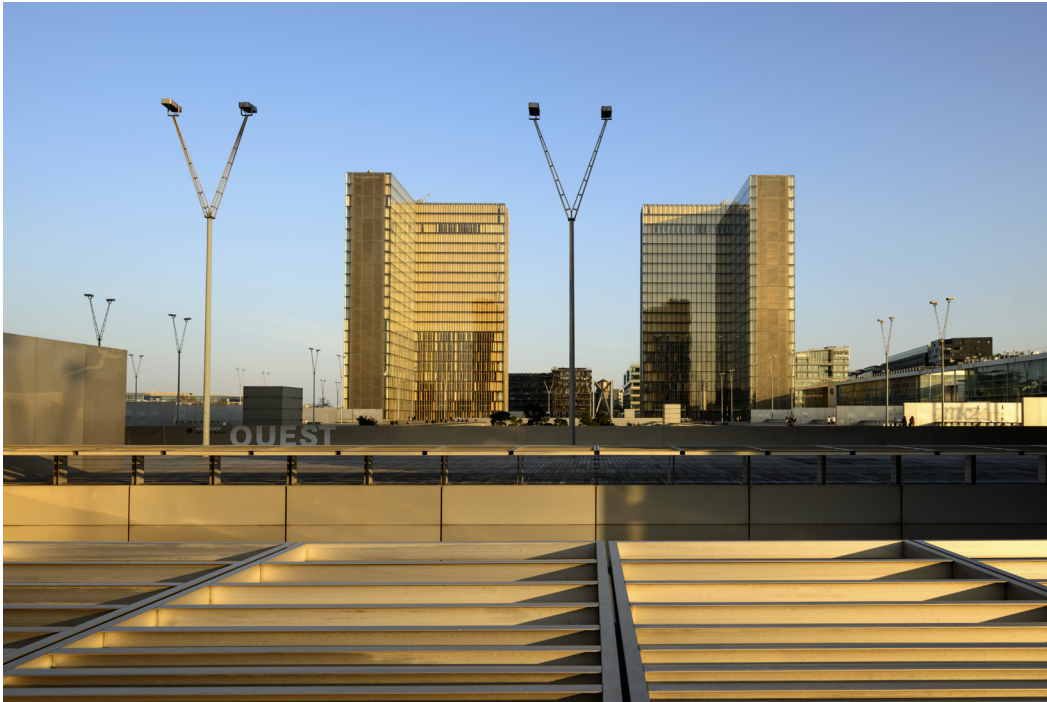
Bibliothèque Nationale de France, Site Tolbiac