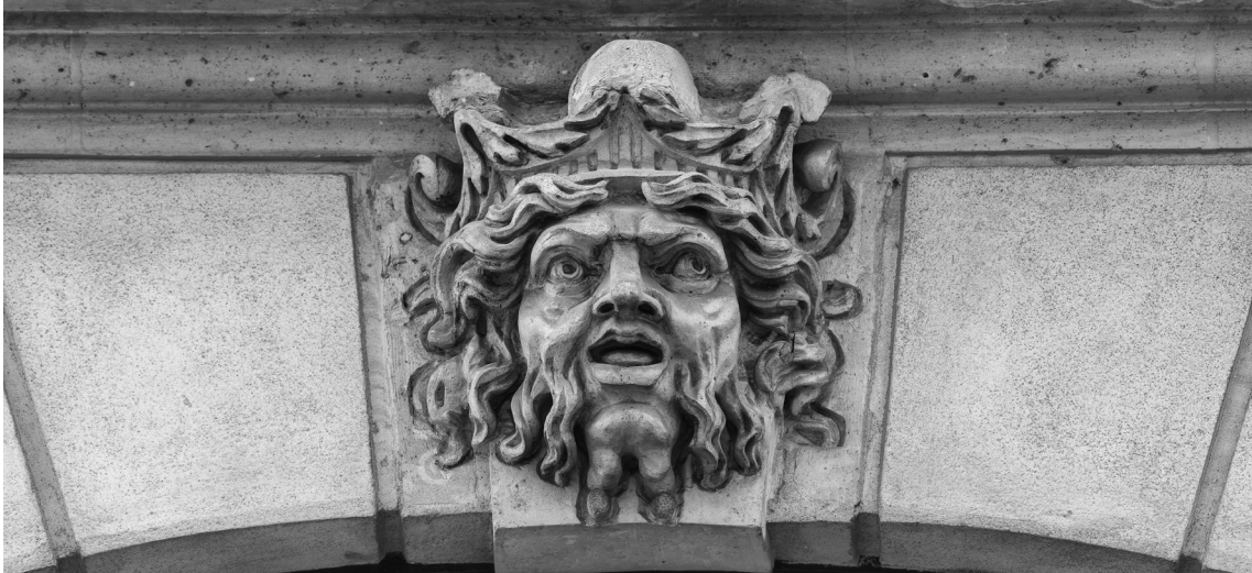
DFK Paris, a theater mask of the Lully Palais. Each top of the windows at the ground floor is decorated with a mask.