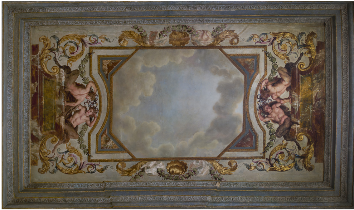
DFK Paris, 2 nd floor, the ceiling of the Salle Lully, 17 th century.