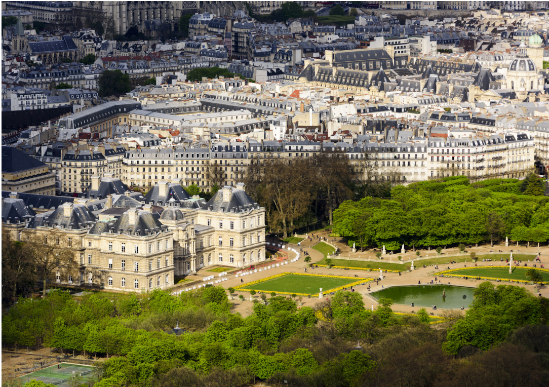
The Jardin Luxembourg and the Senate