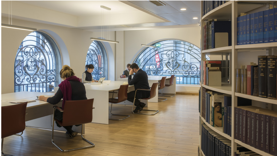
DFK Paris, 1 st floor, the Library.