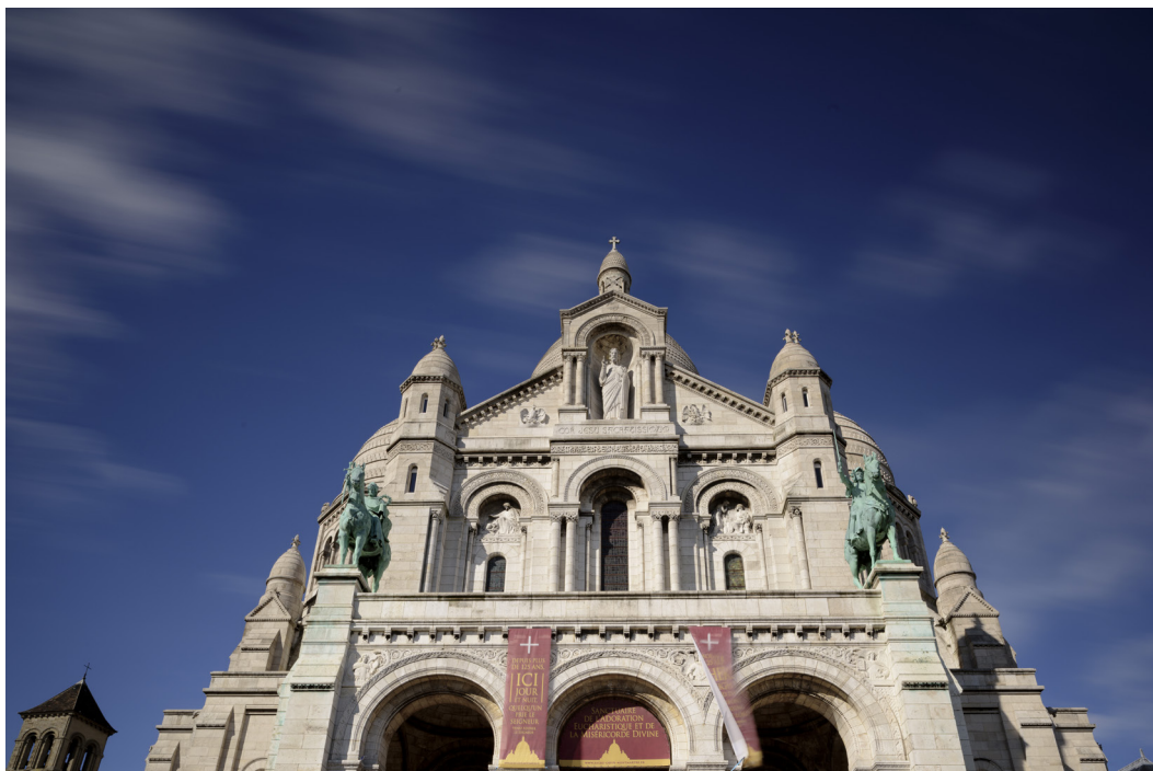
The church Sacré Cœur (Entrance)