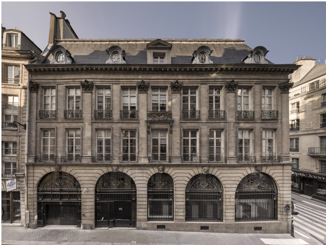
DFK Paris, view of the old entrance on the east side.