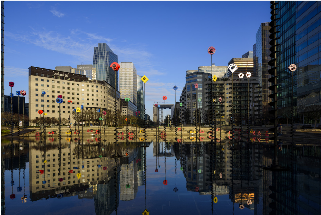
La Défense and the bassin of the artist called Takis