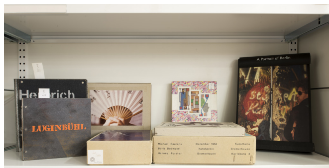
DFK Paris, Library, a selection of precious books.