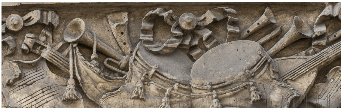
DFK Paris, frieze on the east side, 17 th century.

The palais of Jean-Baptiste Lully (1632-1687) were constructed between 1670 and 1671. Today you can visit the room Lully called Salle Lully .